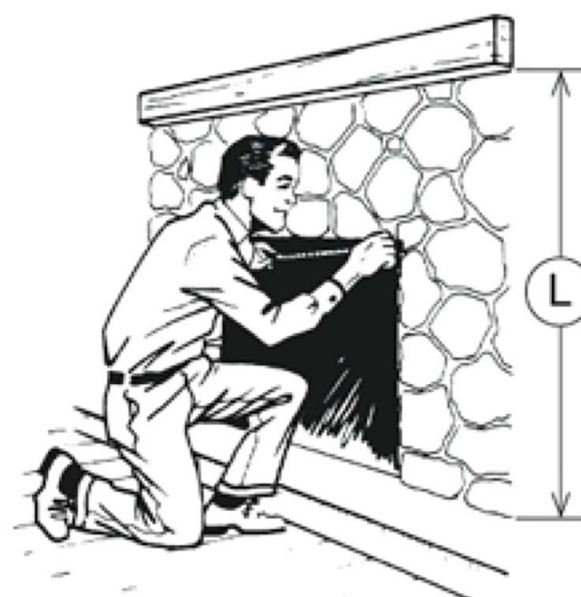
Other Useful Information

Note: Dimensions A through E are the most important.